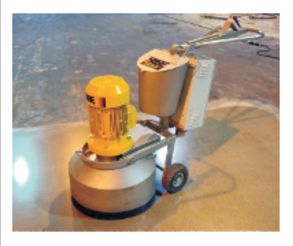
"Newly patented advances in dry polished concrete eliminate primitive wet grinding slurry byproducts that typically required landfill disposal."

Reflective properties of the high gloss finish of a polished concrete floor reduce initial light fixture costs by reducing the amount of ambient lighting fixtures needed, as well as reducing the energy needs for existing interior lighting. L&M Construction Chemicals, Inc. calculated that depending on the type of colored floor used in the FGS/PermaShine process, the floor surface can increase the reflection of as much as 35 percent of light, further increasing energy performance. Remarkably, with simple maintenance an FGS/PermaShine floor becomes shinier over time, even with increased foot traffic, which in turn can add to the high-gloss reflectivity of the system.