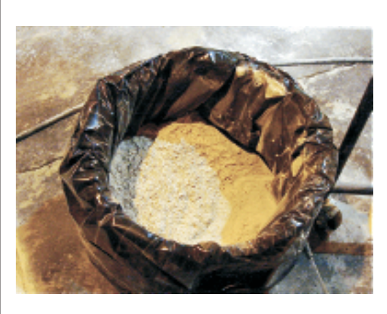
The patented FGS/PermaShine Dry grinding process minimizes landfill wastes.

Section 6: LEED-NC 2.2 (New Construction and Major Renovations, version 2.2) (Continued)