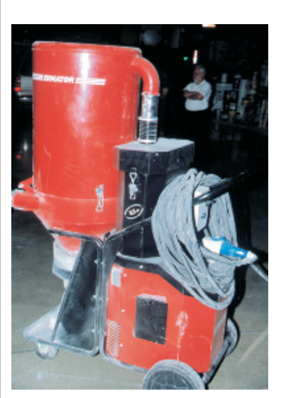
"Up to 98% of the potential airborne grid particles are captured in a vacuum filter during installation of a mechanically installed Polished Concrete Floor System. This allows warehouse workers and valuable stock or cargo items to remain on site during installation."

Section 6: LEED-NC 2.2 (New Construction and Major Renovations, version 2.2) (Continued)