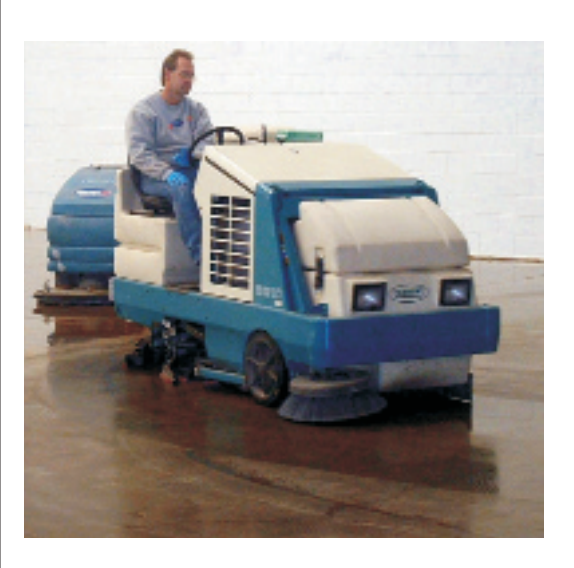
"VOC-Free FGS Hardener Plus chemically hardens and densifies concrete surfaces, extending the life of the surface while reducing cost, delivering superior shine, safety, and NFSI Certified Non-Slip performance."

Section 6: LEED-NC 2.2 (New Construction and Major Renovations, version 2.2) (Continued)