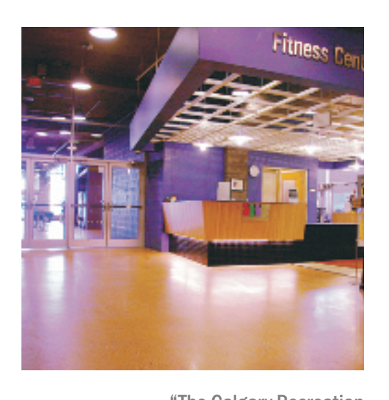
"The Calgary Recreation Center achieved LEED Gold certification with a Polished Concrete Floor System from FGS/PermaShine"

Faced with government mandates, building owners' demands, and increasingly expensive resources, building teams throughout North America are under pressure to build green. Efforts to mitigate the impact of growth by protecting the environment are having financial as well as social benefits. To participate in this movement, building teams need new design strategies and sustainable products to execute these designs.